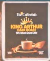
KING ARTHUR DARK ROAST COFFEE: CSU'S ROYAL BLEND