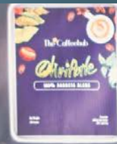
OLIVANTE 100% ROBUSTA BLEND

Step into the realm of bold flavors with King Arthur Dark Roast Coffee. This blend embodies the strength and loyalty of the Valena heritage. Just as King Arthur's dark roast is a reminder of the rich, robust character of the Valena coffee, this blend is a reminder of the strength and loyalty of the Valena heritage.