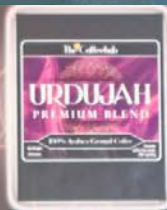
URDUJAH PREMIUM BLEND ARABICA COFFEE: A TASTE OF STRENGTH