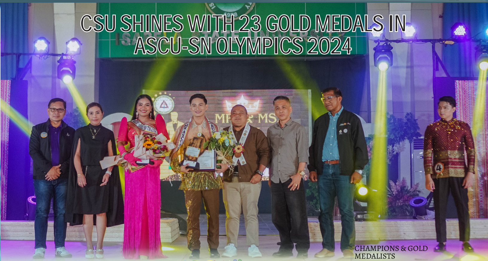
CHAMPIONS & GOLD MEDALISTS